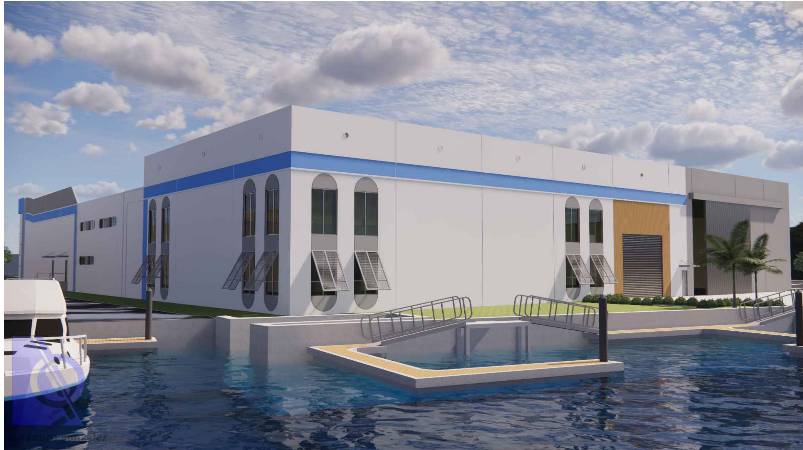
A1 NORTH WEST CORNER NOT TO SCALE