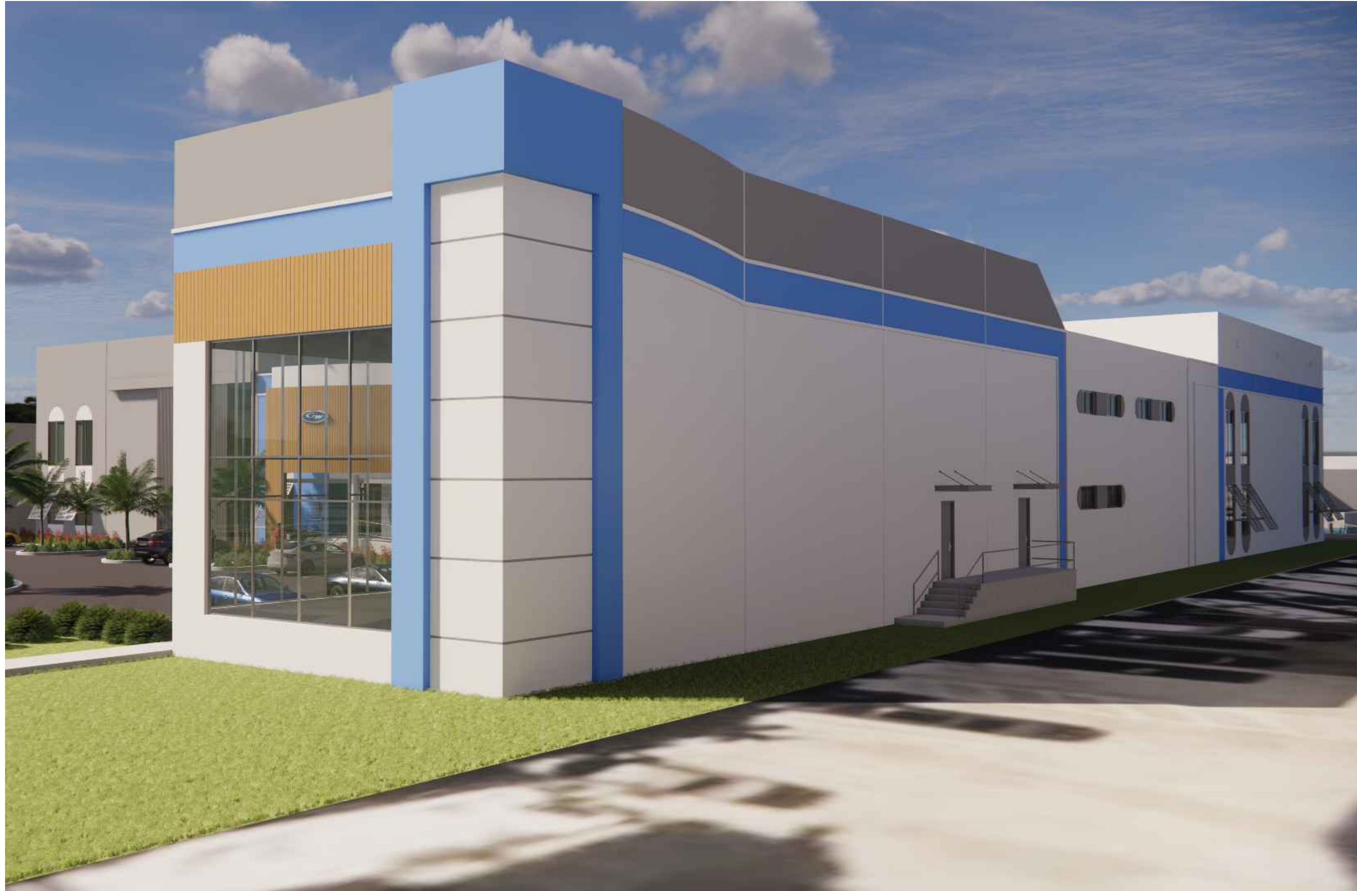
C4 NORTH EAST CORNER NOT TO SCALE