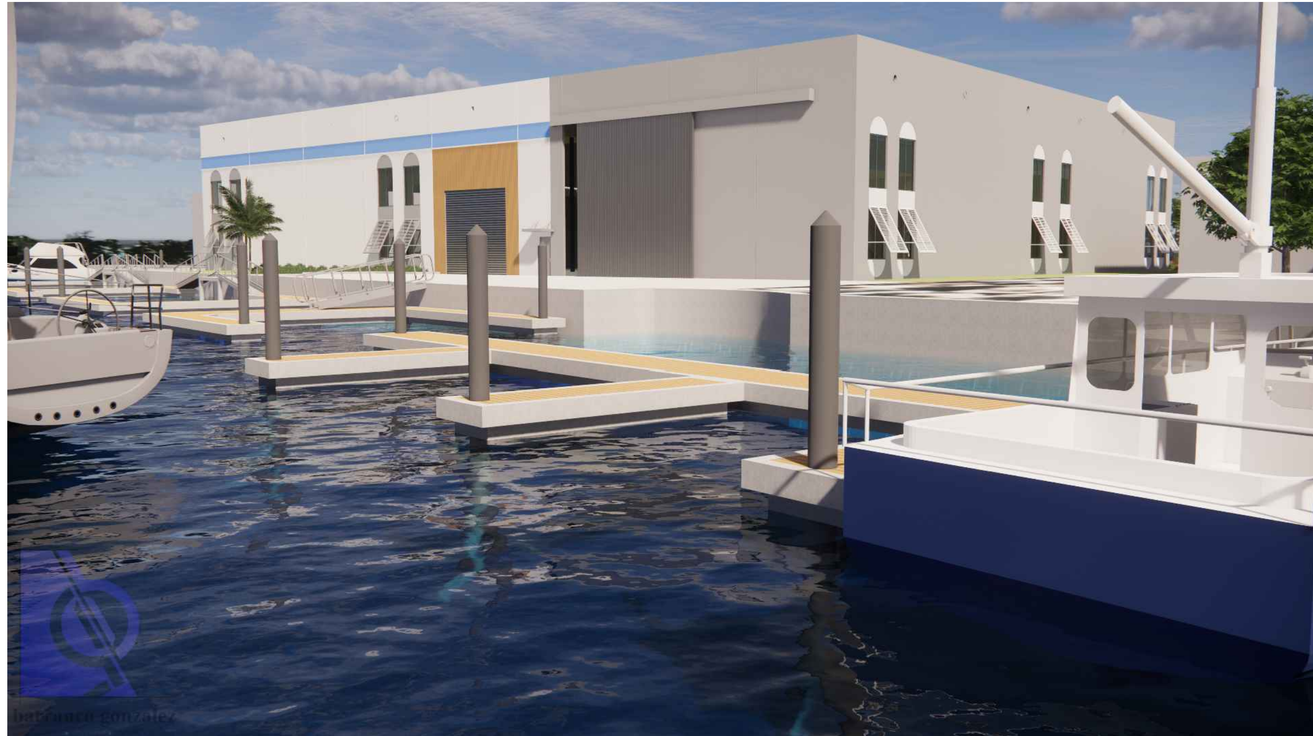
A1 SOUTH WEST CORNER NOT TO SCALE