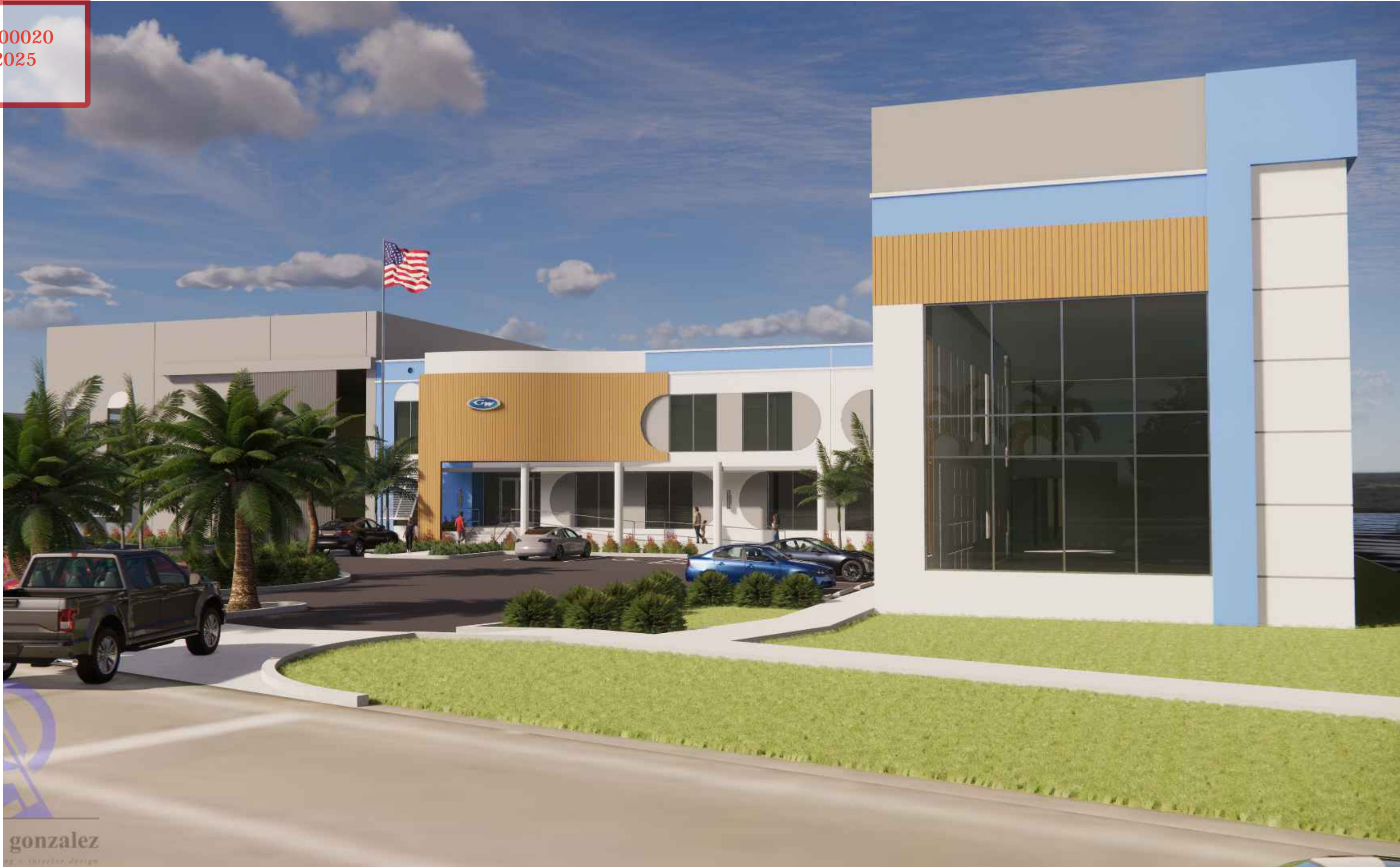
C1 FERDERAL SOUTH BOUND VIEW NOT TO SCALE